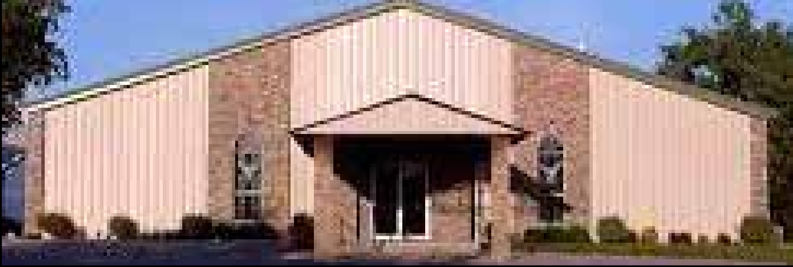
Example of 70 ft x 100 ft Metal Frame Church Building